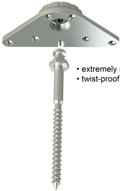
Table base mounting INDUFIX